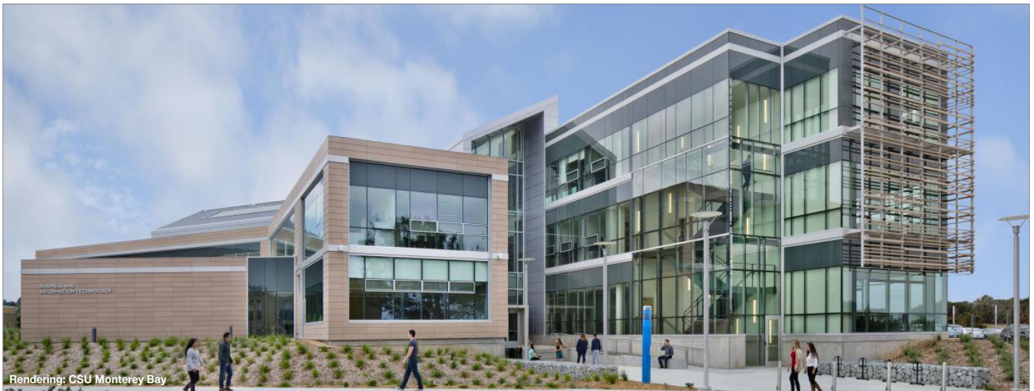
Rendering: CSU Monterey Bay