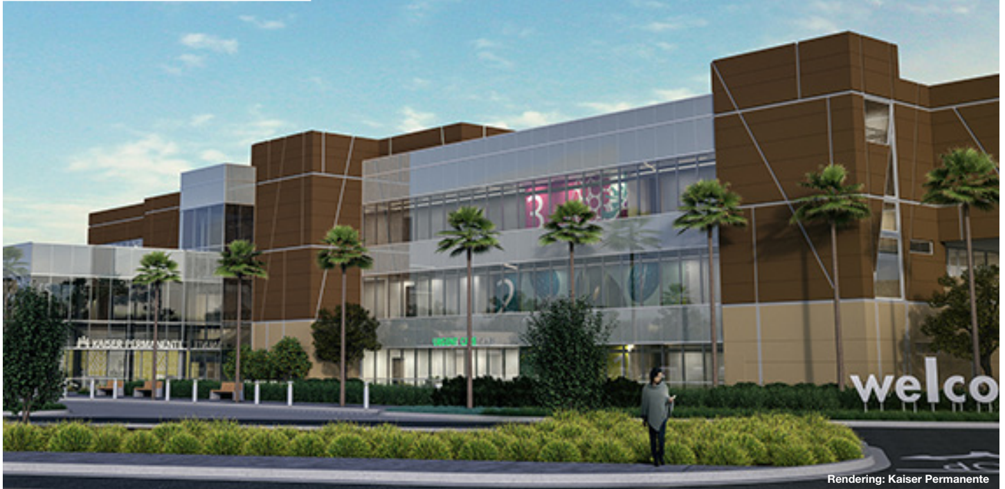
Rendering: Kaiser Permanente