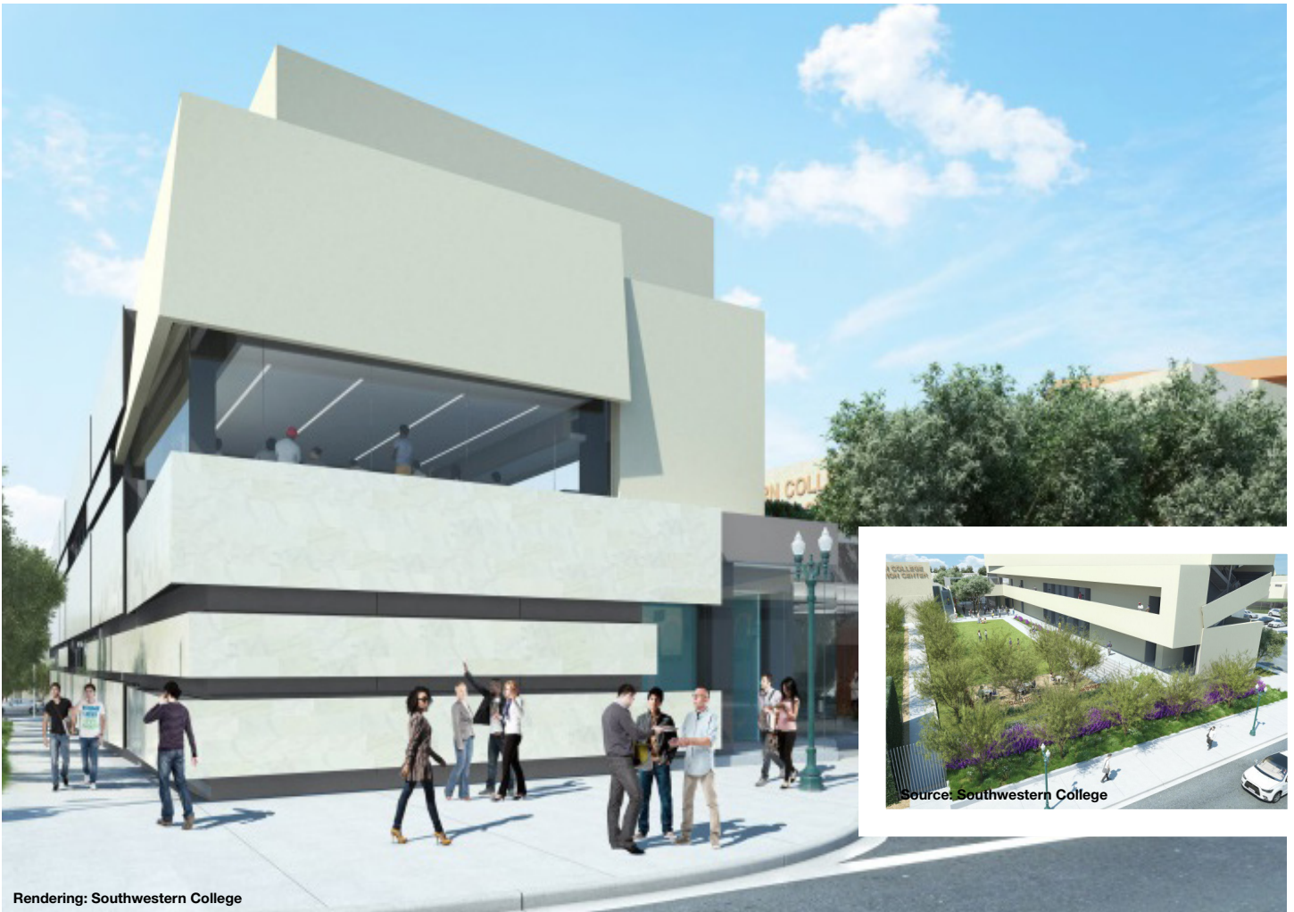
Rendering: Southwestern College