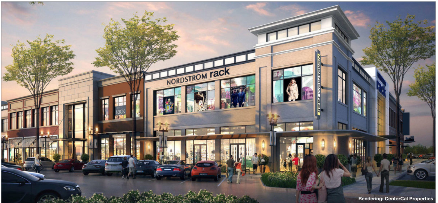
Rendering: CenterCal Properties