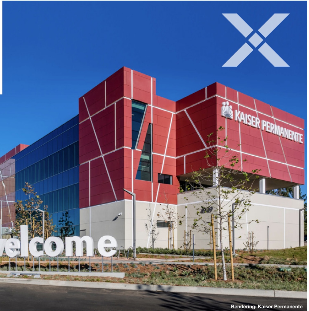
Rendering: Kaiser Permanente